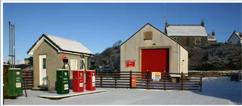
The Petrol Station