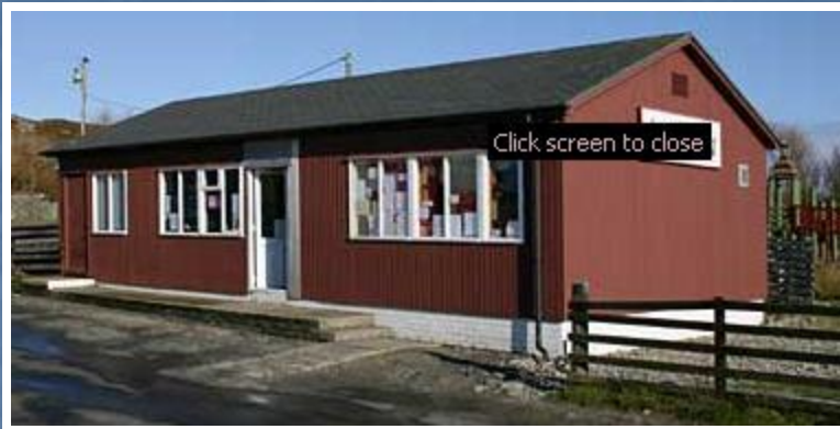
The General Store