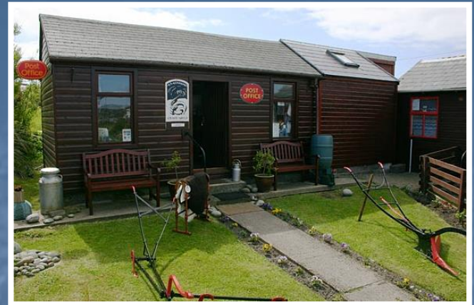
The Post office