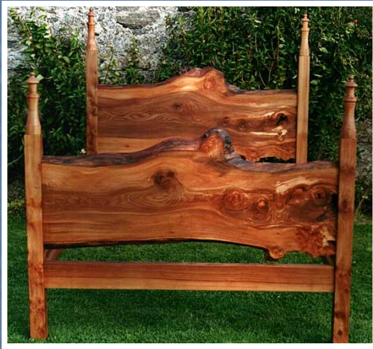
Traditional wood turner and furniture maker

There are lots of artists and crafts people who live and work on the island.