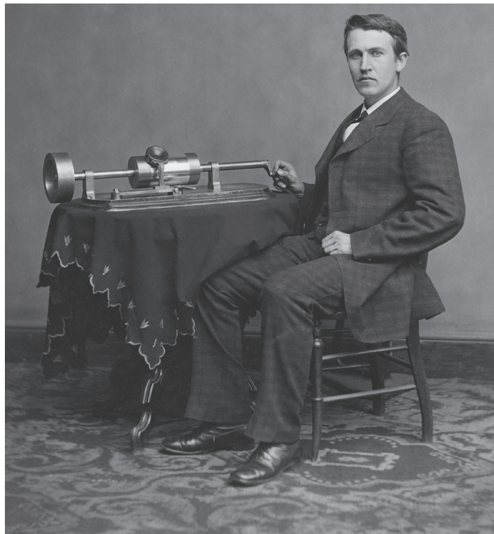
Edison with his phonograph invention.

Thomas Edison died in 1931; he was 84 years old. Almost everyone in the world has used at least one of his inventions: the electric lightbulb. We are still using them today, almost 100 years later!