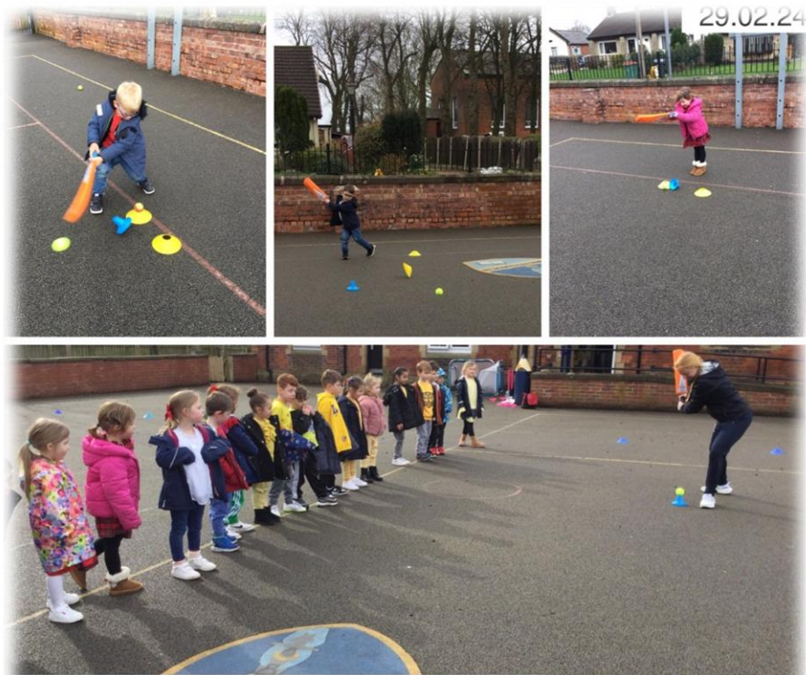
Our first cricket lesson