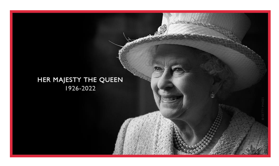
Eternal rest grant unto her O' Lord and let perpetual light shine upon her. May she rest in peace. Amen.

We will continue to celebrate and reflect upon her life in the weeks ahead and continue to offer our prayers.