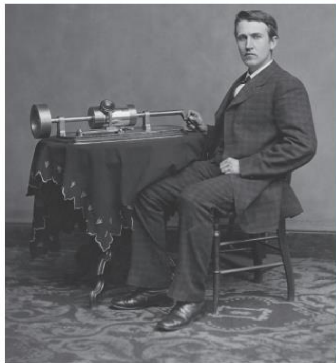
Edison with his phonograph invention.

Thomas Edison died in 1931; he was 84 years old. Almost everyone in the world has used at least one of his inventions: the electric lightbulb. We are still using them today, almost 100 years later!