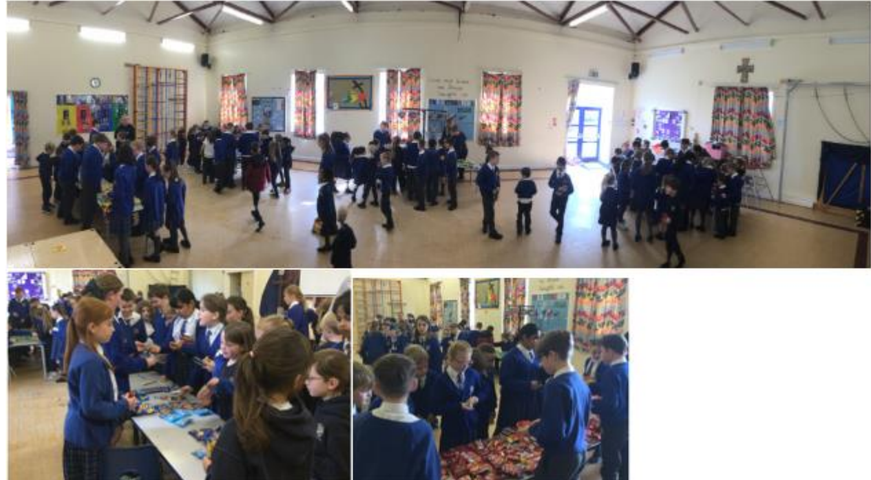
Next week our Lenten Fundraiser is Tuck Shop Stalls.

The children had a great time visiting the colour stalls today and finding some bargains. Thankyou for all the donations of items, we raised a fantastic amount of £291.00